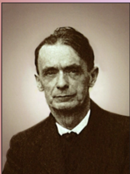
Rudolf Steiner February 1861 - March 1925

May the members come to meet us with the same feelings as we cherish for the Society, so that we may actively work on and on according to the intentions of our leader Rudolf Steiner, and bring to effect the legacy of the Christmas Foundation Meeting.